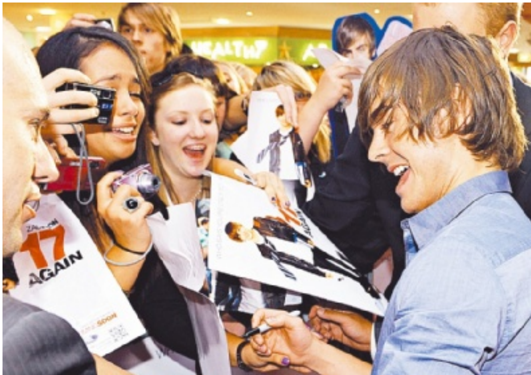
Teen pin-up: Zac Efron attracts hordes of screaming fans wherever he travels the world over

directed me in Hairspray , came up with the idea and he asked me about it," Efron says.